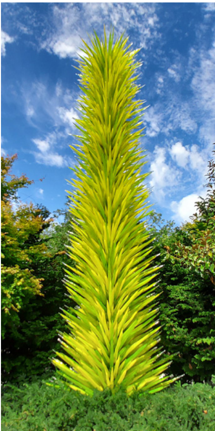
Chihuly Garden and Glass, Seattle, WA.