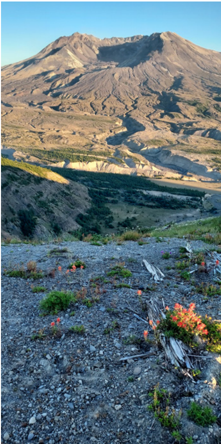
Mount St. Helens, Skamania County, WA.