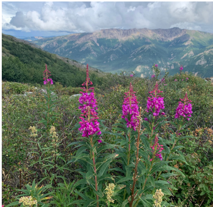
The fireweed was everywhere in Denali National Park, Alaska.