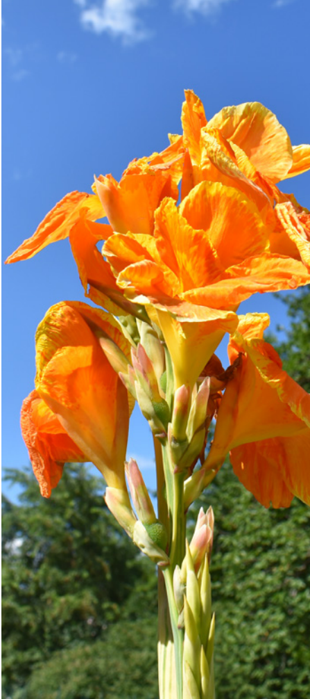
Canna flower

Rick has also made a brochure that will be placed in the proposed library box to be built in collaboration with Jeff Tryon.