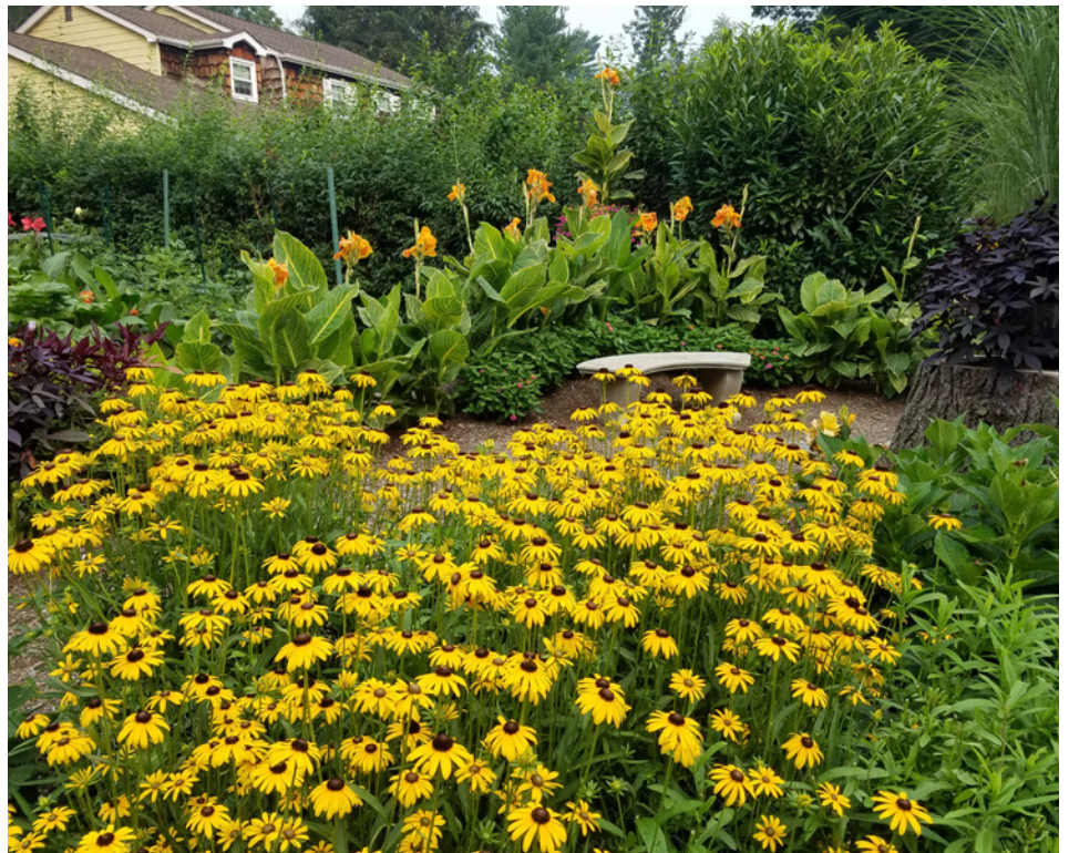
A view of Black-eyed Susans across to a tall stand of Cannas.