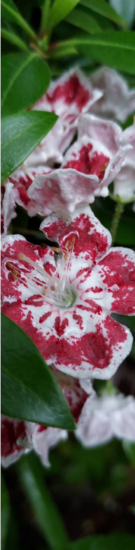
Mountain Laurel