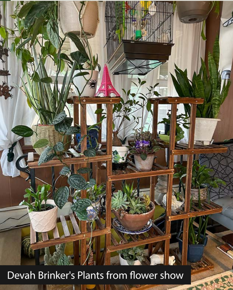
Devah Brinker's Plants from flower show