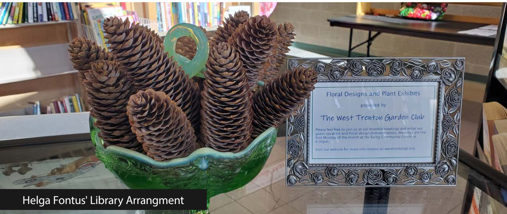
Helga Fontus' Library Arrangement